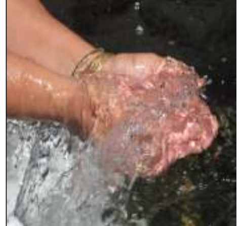
The waters of 'Āao, Maui...