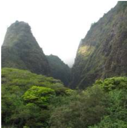
'Āao Valley, Maui Island